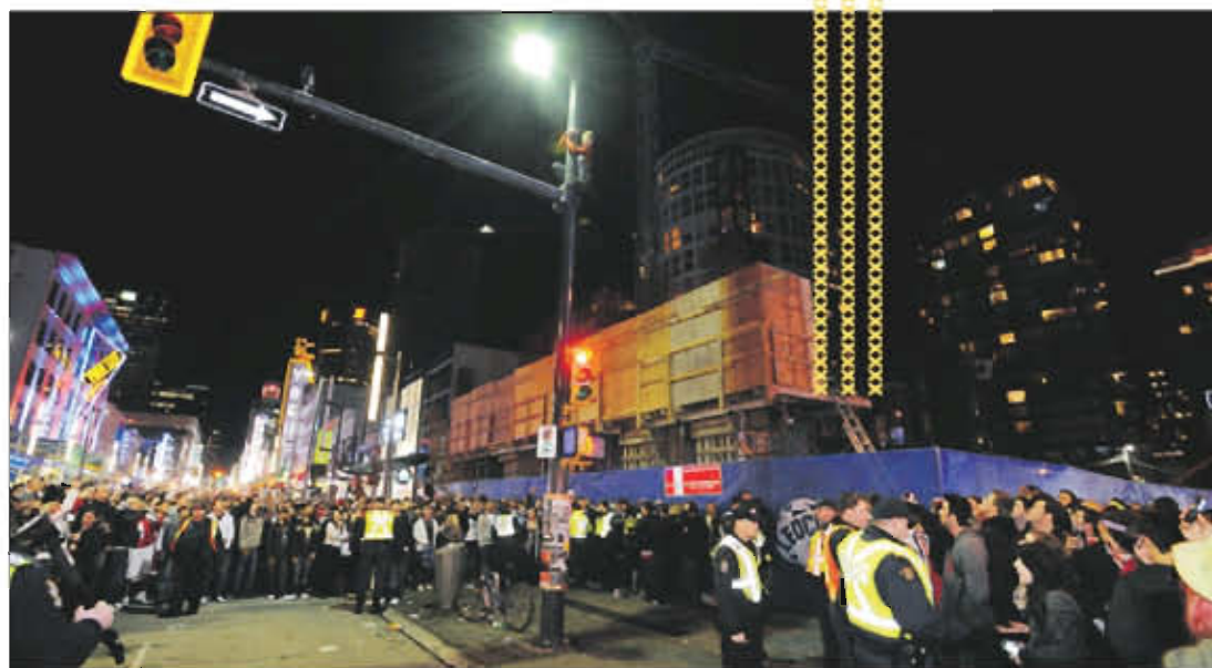
City police keep back crowd before arresting man who climbed lamp standard Friday.

As police brace for the third and final Olympic weekend, memories persist of the 1994 Stanley Cup riot,